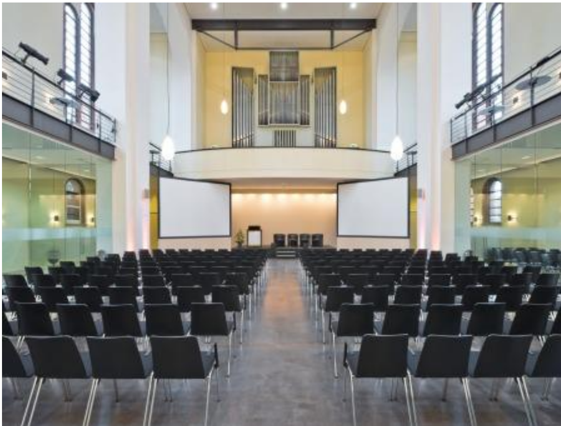
Figure 2: Umweltforum – main hall

The project team reserved the Umweltforum, Pufendorfstr. 11, 10249 Berlin for the meeting and the evening reception. The foyer as well as the main hall and several separate meeting rooms are available.