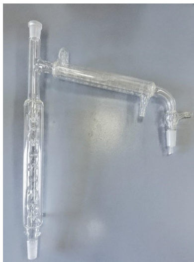
Fig. 1: Parts of the distillation apparatus: Vigreux column and Liebig condenser

3.3.6 The counting vial is closed tightly and the mixture is homogenised by shaking.